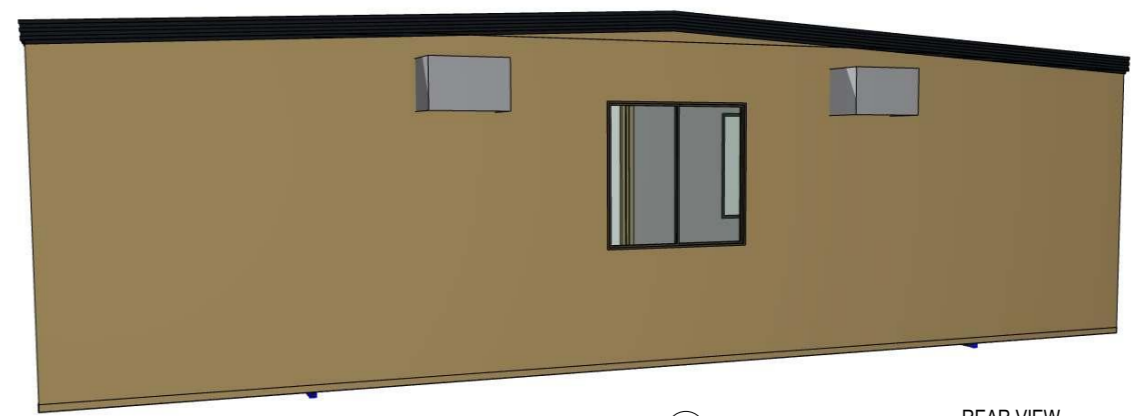
4 REAR VIEW 1:14683.83