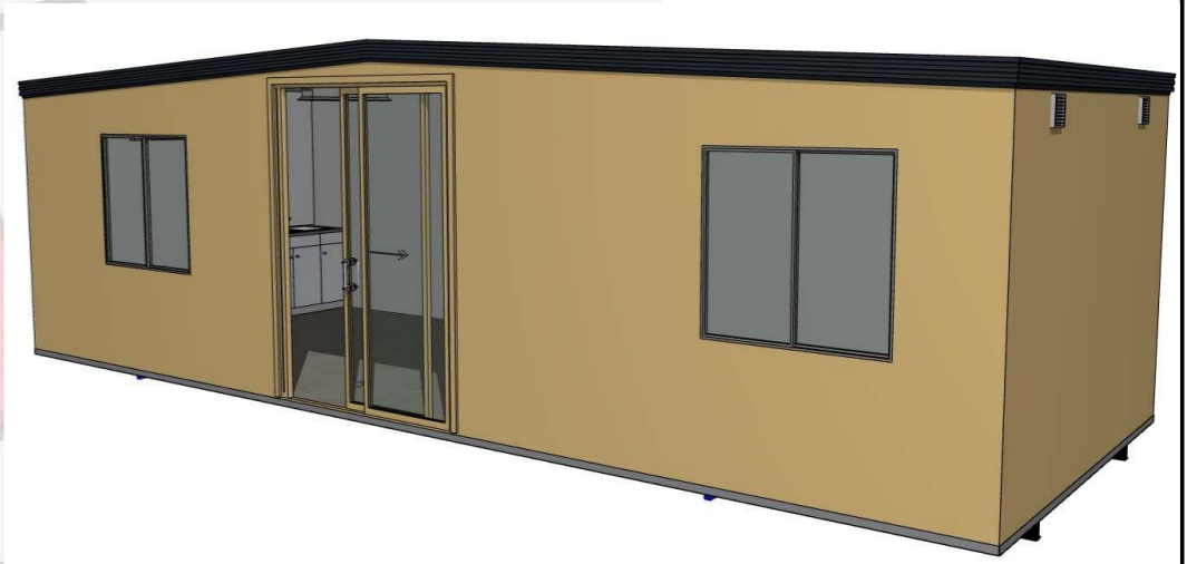
3 3D FRONT VIEW 1:17076.95